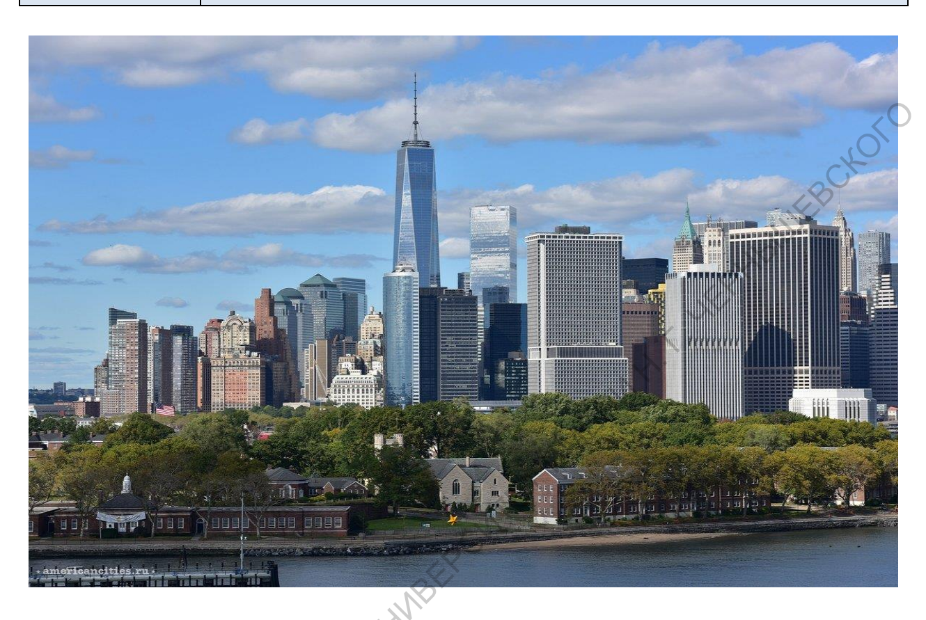
Part 1 The USA: General Information