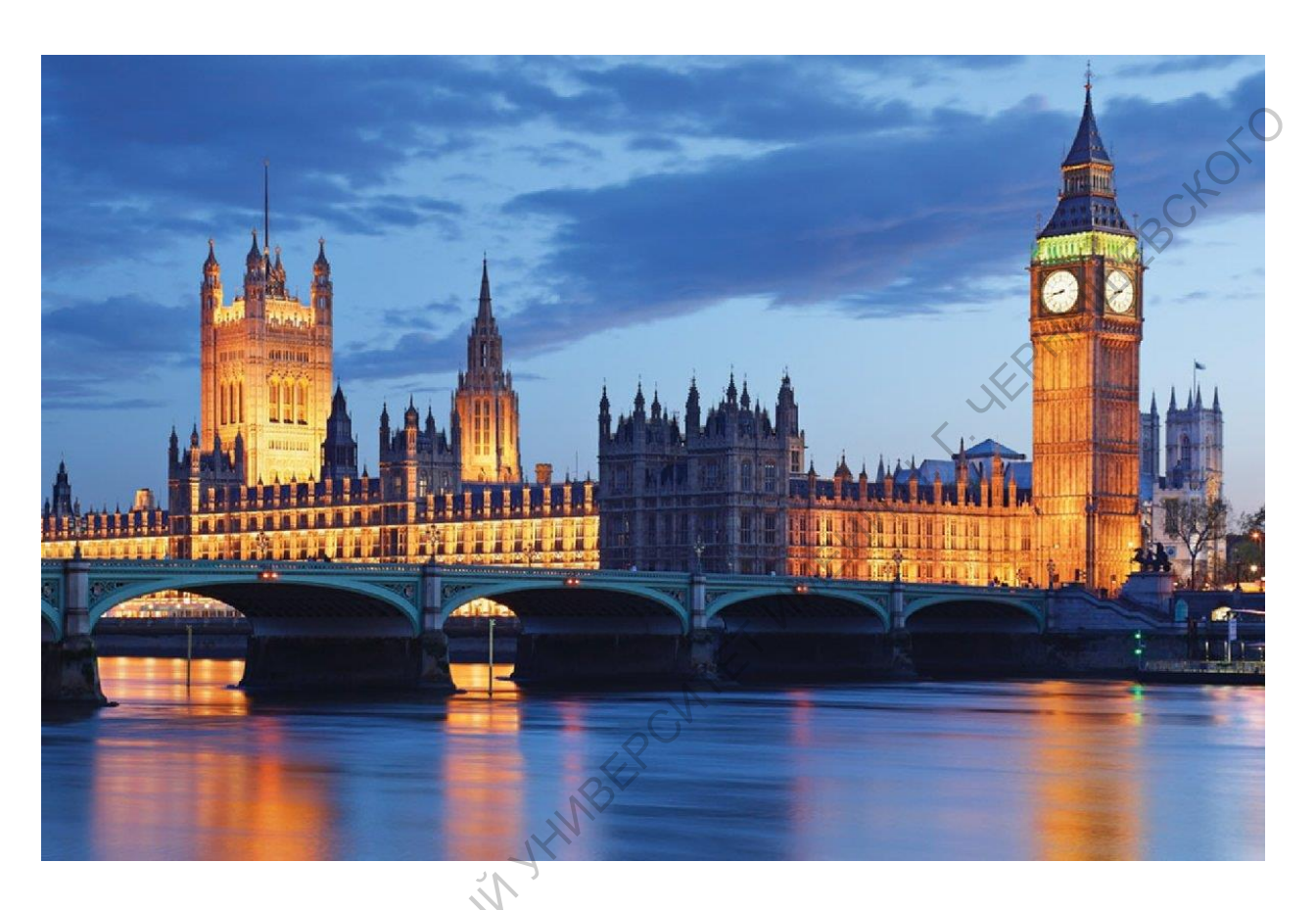
Part 1 The UK: General Information

The UK is situated north-west of the European continent between the Atlantic Ocean and the North Sea. It has a total land area of 244,100 square kilometres, of which nearly 99% is land and the remainder inland water. From north to south it is about 1,000 kilometres long.